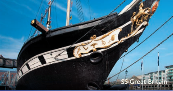
SS Great Britain