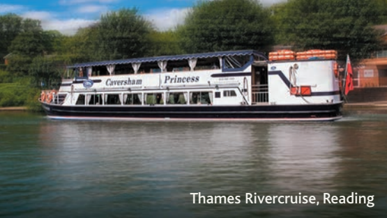
Thames Rivercruise, Reading