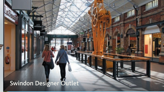
Swindon Designer Outlet