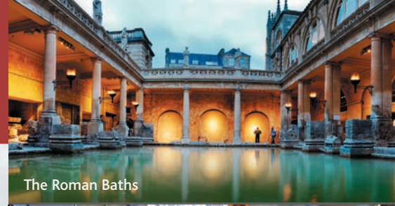
The Roman Baths